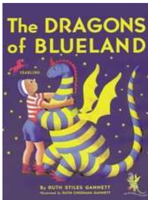
The Dragons of Blueiland (1951) by Ruth Stiles Gannett Illustrations by Ruth Chrisman Gannett

Elmer and the dragon are stranded on a remote island inhabited only by canaries. One of them, Flute, was Elmer's pet until he escaped to Feather Island. Elmer helps Flute and the king and queen canaries to dig up a chest that the island's former human settlers left. Inside are various household items, a watch, a harmonica, and six bags of gold. The dragon flies Elmer back to his house before returning to Blueiland, his own home.