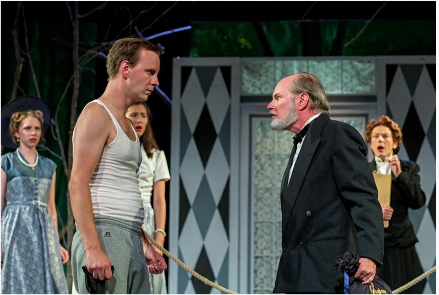
A scene from "As You Like It" at The Theater at Monmouth